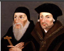
Sts John Fisher & Thomas More

21st St Aloysius Gonzaga, Religious (1568-91), Memorial Feast; St Eusebius, Bishop (d379) 22nd St John Fisher, Bishop & Martyr (1459-1535), Optional Feast St Thomas More, Martyr (1478-1535), Optional Feast 23rd St Joseph Cafasso, Priest (1811-60) 24th Birth of St John the Baptist, Prophet & Martyr, Solemnity 25th St Prosper of Reggio, Bishop (d466) 26th St Josemaria Escriva de Balaguer, Priest & Founder of Opus Dei (1902-75) 27th St Cyril of Alexandria, Bishop & Doctor (c370-444), Optional