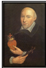
St John Eudes

Sunday St Stephen, King (977-1038), Optional Br Roger Schutz, Anglican, Taize Founder (1915-2005) Monday St Clare of Montefalco, Virgin, Abbess (1268-1308) Tuesday St Helena – Widow (250-330), Mother of Constantine (Roman Emperor) Wednesday St John Eudes, Priest (1601-1680), Optional Thursday St Bernard, Founder, Abbot, Doctor (1090-1153), Memorial Friday St Pius X, Pope (1835-1914), Memorial; Our Lady of Knock, Irish Feast (1879) Saturday Queenship of Mary (Instituted 1955), Memorial