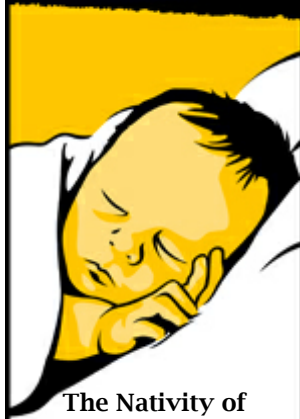
The Nativity of Saint John the Baptist Year B